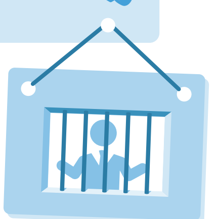
Possible loss of their Operators licence

In cases of tachograph fraud, imprisonment